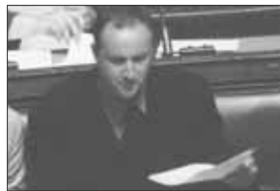
Jan Mortelmans, MP

or demanded that the country be split, like the Vlaams Blok does?" Jahjah asked ( P-Magazine , 3 May 2002). Indeed, he is not an enemy of Belgium, but of Flanders and the Western world.