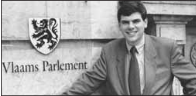
Filip Dewinter, MP

In democracies important public issues are subjected to public debate. We believe that if people are not allowed to express their opinions, including their fears, there can be no public debate. The fear is not going to go away simply because it is kept in a dark corner.