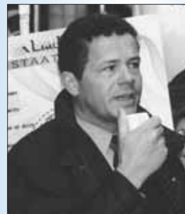
Frank Vanhecke, MEP President of the Vlaams Blok

The growth of my party is inspiring fear in the corrupt Belgian establishment. As the Belgian authorities cannot stop the people from voting for us, they are now trying to outlaw us. The Belgian regime – the most