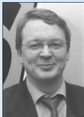
Senator Jurgen Ceder