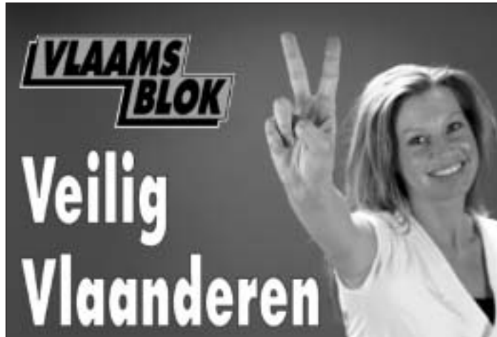
“Veilig Vlaanderen, Vrij Vlaanderen – A Safe Flanders, a Free Flanders” The election poster of the Vlaams Blok.

The political atmosphere in Belgium is undemocratic and intolerant. Of course, this hinders us, because the violent acts of our adversaries intimidate potential Vlaams Blok members and