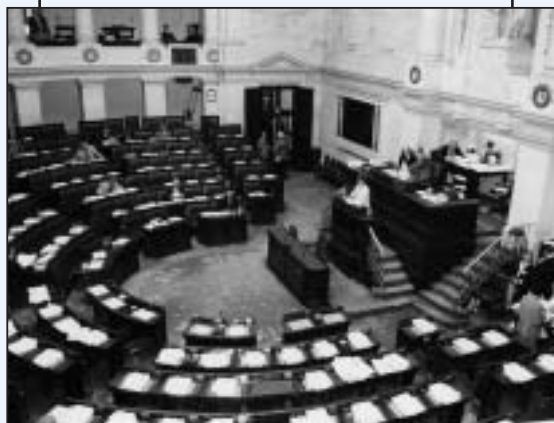
The Belgian Parliament

Vlaams Blok and the Francophone Parti Socialiste (PS) gained almost the same number of votes in the 1999 general elections (9.9 % of the Belgian electorate for the Vlaams Blok against 10.1 % of the