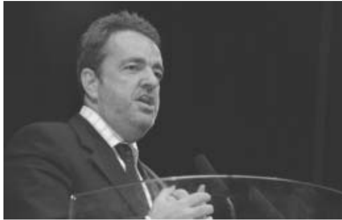
Gerolf Annemans, MP Parliamentary leader of the Vlaams Blok

Like the rest of Europe, we are witnessing a demographic implosion. The Flemings do not have enough