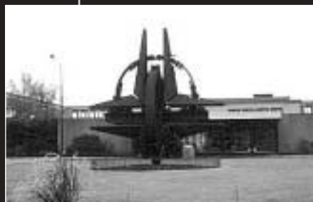
The NATO Headquarters in Brussels.

meetings in Brussels if Belgium takes him to court, the Belgian Parliament voted a bill to restrict its universal competence law, limiting the cases which can be prosecuted in Belgium. This bill only passed because the Vlaams Blok voted in favour of it. The governing Socialist and Green parties wanted to keep the law as it was. For the time being, at least, U.S. President George W.