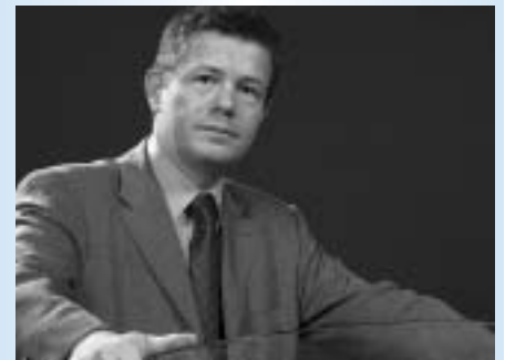
Frank Vanhecke, MEP President of the Vlaams Blok

Nevertheless, for all those who are interested in what we have to say ourselves, we provide this newsletter: the voice of the Vlaams Blok; the voice of the Free Flanders.