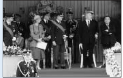
King Albert II Needed by the Regime.

"Belgium needs the monarchy like people need bread," the Socialist Prime Minister Achilles Van Acker said in 1945. This must be taken literally. "The monarchy is the only way to keep an artificial state such as Belgium together. In a homogeneous country, I would be a republican, but not in Belgium," the Socialist leader Louis Tobback said in December 2001.