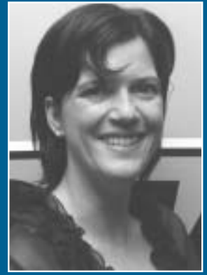
Senator Gerda Staveaux- Van Steenberge

Belgium boasts the most liberal euthanasia law in the world. Recently it also legalised gay marriages and the constructing of human embryos specifically for use in therapeutic medical experiments. Even the Christian-Democrat Party approves of this. The Vlaams Blok is the only party that opposes legislation undermining the foundations of our civilisation.