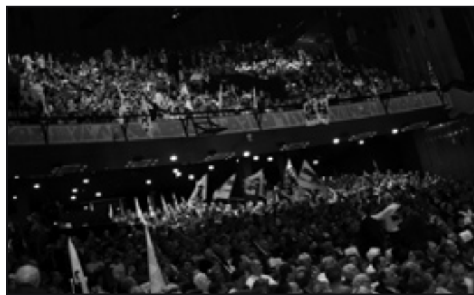
Soon to be banned?

Some now want to go to bed with their ministers.