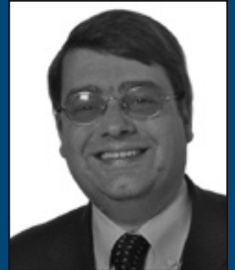
Jan Penris, MP “The Vlaams Blok is the party of sound economics.”

The situation is worst for elderly Belgians. In the age group between 55 and 64, only 25% of the Belgians have a job, the lowest percentage in Europe. The Vlaams Blok wants to restore sound economic principles, by allowing people to keep a larger share of what they earn.