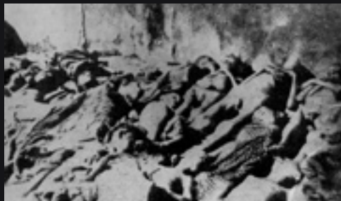
The new Brussels Secretary of State says the monument to the Armenian genocide should be destroyed.