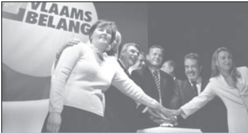
Inspired by Jefferson and Reagan.

tions higher than 125 euros. Belgium's political parties are financed by the state. They can, however, be deprived of their state subsidies by a parliamentary majority in case of... a conviction for "racism."