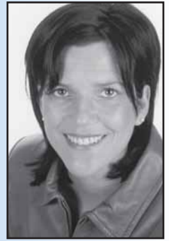
Gerda Van Steenberge, MP

Twenty European countries have witnessed a significant rise in drug abuse from 1998 to 2003. The number of drug addicts in the EU is estimated to be between 1.2 and 2.1 million. 9 million Europeans are said to have experimented with drugs. Drug abuse is one of the things parents worry about most. The government has a responsibility in fighting drug abuse. It is a fact that so-called "soft" drugs lead to hard drugs. The rise in drug abuse is undoubtedly the result of the soft approach that many governments, including Belgium's, have adopted towards "soft" drugs in the past five years.