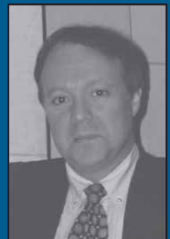
Filip De Man, MP

The catastrophe we are witnessing is entirely self-inflicted. The only way to stop it, is to adopt a policy of zero tolerance towards people who do not respect our values and want to establish independent Muslim enclaves in our country.