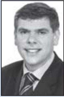
Filip Dewinter, MP gets "neutral and balanced" coverage in foreign media

Since Vlaams Belang (Flemish Interest), formerly Vlaams Blok, became Belgium's largest party, the international media have given it a lot of attention. This attention is focussed mainly on Antwerp, where the local 42 year old VB leader Filip Dewinter , "a boyish man in a suit" according to The New York Times (Feb. 12), is poised to win the municipal elections next year. The NYT rightly points out that "many of [the VB] supporters [in Antwerp] are Jews who feel threatened by a new wave of anti-Semitism emanating from Europe's growing Muslim communities."