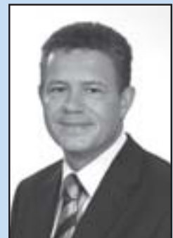
Frank Vanhecke, MEP Vlaams Belang Party Leader

The Vlaams Belang strives for Flemish independence, not because we want to have a nation-state for every ethnic group, but because we demand democracy for Flanders . The Vlaams Belang says to the Flemish people what George W. Bush said to the world in his State of the Union on Jan. 20: "When you stand for your liberty, we will stand with you."