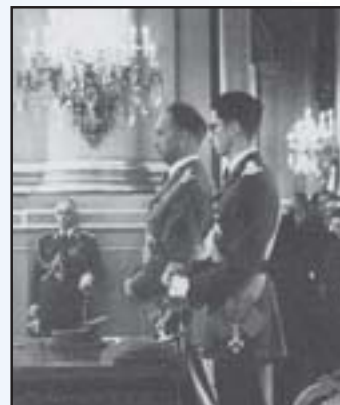
Leopold III and Baudouin

fact that the King is the only son of a former Nazi collaborator to play a role in Belgian politics, the Belgian regime is constantly trying to link the Flemish secessionists to the Nazis, with the accusation that the Vlaams Belang be run by "the sons of former Nazi collaborators."