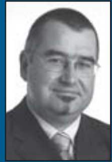
Karim Van Overmeire, MP

Vlaams Belang wants the Flemish people to decide in a referendum whether or not it approves the so-called European Constitution. The Belgian Constitution does not allow referendums on the federal level, but according to Karim Van Overmeire , a Vlaams Belang member of the Flemish Regional Parliament, it is the democratic duty of Flanders to organise a referendum: "The European Constitution is a very important treaty with far-reaching consequences," he says. "It will have priority over the Belgian Constitution, although it only needs the approval of an ordinary majority in Parliament and not the two-third majority that is normally required for changes to the Belgian Constitution. Hence, I think it is only normal that the voice of the people be heard directly."