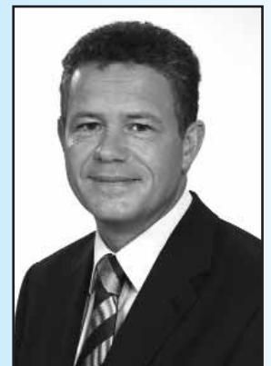
Frank Vanhecke, MEP President of the Vlaams Belang "A multi-national democracy does not exist."

A people cannot accept that there are suddenly living two peoples on its territory. We defend the Flemish national interests against the Belgian state and the European superstate, but also against immigrants who abuse our hospitality to wage an anti-Western war. The Vlaams Belang is a party of Flemish patriots, defending Flanders' interests: its culture, its traditions, its values, its freedom.