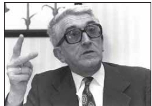
Karel Dillen (1925-2007), the founder of the VB.

3,000 people came to his funeral in Antwerp Cathedral, making it one of the most attended funerals of the past decade.