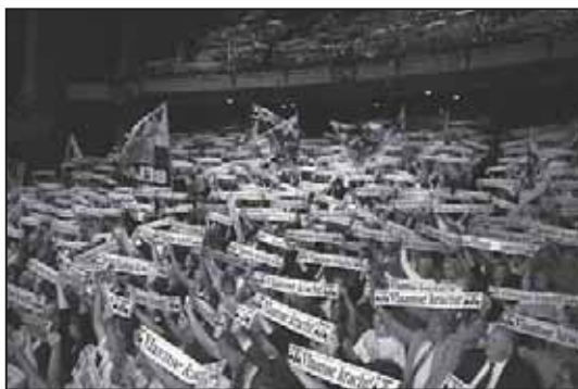
VB election congress: Vlaamse Kracht = Flemish Power

“We oppose the centralists in Brussels.”