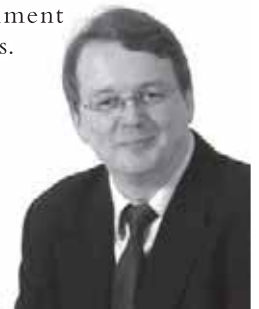
Senator Jurgen Ceder:

consequences. In Belgium, the official trade unions have considerable rights and privileges, granted them by the state, including the distribution of unemployment benefits. Belgium is the only country in Europe where such benefits are distributed by the trade unions, instead of by accountable government agencies.