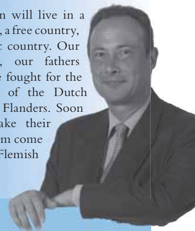
Bruno Valkeniers Vlaams Belang party leader

Our children will live in a new country, a free country, a democratic country. Our grandfathers, our fathers and we have fought for the preservation of the Dutch character of Flanders. Soon we will make their and our dream come true: the Flemish Republic.