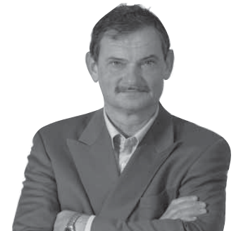
Luc Sevenhans MP:

"The creation of a Flemish Federation of Medical Doctors is long overdue."