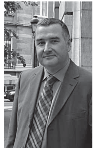
Senator Karim Van Overmeire: "The best way to improve our international image is to abolish Belgium."

that incidents like this will not improve Belgium's international reputation. Belgium is listed 152nd in a list ranking 200 countries by their reputation, behind countries such as Algeria, Romania, Libya and even Liberia. Belgium's reputation badly affects the export-oriented Flemish economy.