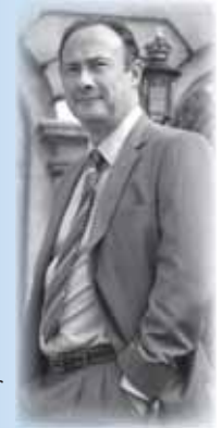
Bruno Valkeniers Vlaams Belang party leader

Non-Belgians often wonder why Flanders so patiently puts up with the humiliations and with the contempt for its culture, its traditions and its freedoms. Flanders, however, has always refused to resort to violence. We will achieve our liberty without bloodshed, even if it takes a little longer. Belgium is collapsing. The signs are there for all to see. Soon, Flanders will be a free Republic, able to establish a genuine democracy where respect for the rule of law is a reality.