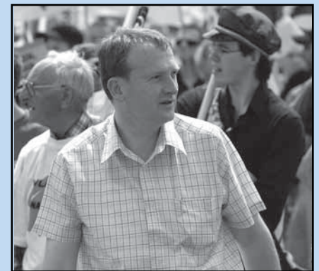
Bart Laeremans, MP: “A state that does not guarantee security and justice has no legitimacy.”

The Vlaams Belang wants to break the destructive hold of the PS over Flanders by cutting the latter loose from Wallonia. “ Our people deserve a proper judicial system, ” says Bart Laeremans , a lawyer and the VB’s parliamentary spokesman for justice. “ The state has the obligation to protect the people against criminals. That is why we pay taxes. Not to fill the pockets of the corrupt Walloon Socialists. ”