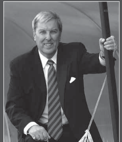
Senator Freddy Van Gaever: "Illegal immigrants should not be rewarded."

"The decision to grant an amnesty to illegal aliens is irresponsible," says Senator Van Gaever. "It tarnishes our international reputation and drains our welfare system."